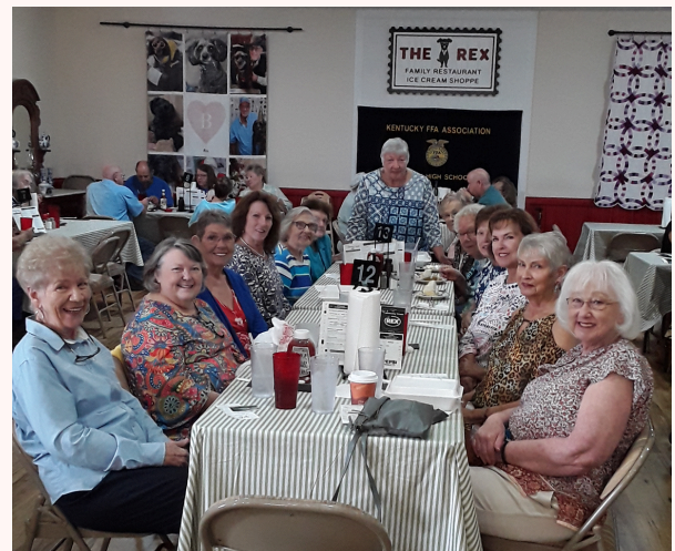
Just Among Friends was selected as the Homemaker Club of the Year.