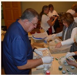
Even our men pitched in and helped.