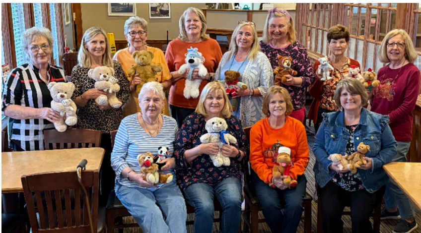
The Hilltopper Homemakers brought Teddy Bears to their meeting to share with the children in Pulaski County. The Bears will be donated to the First Responders in the county to give out to needy children during a trauma.