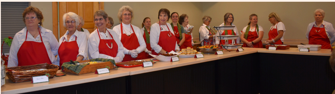
Our ladies wore their Red Aprons and served our 200 people.