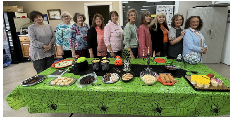
The Meadowlarks also had lots of Foreign Foods at their lesson on Foods from Around the World.