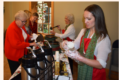
One of the favorite drinks was the Mexican Hot Chocolate.