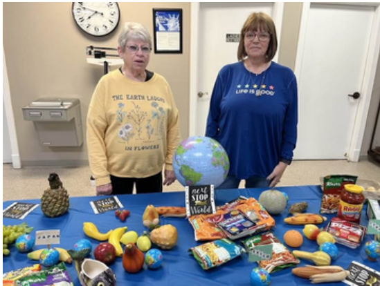
The Hinkle Belle Homemakers enjoyed the homemaker lesson on Foods from Around the World.