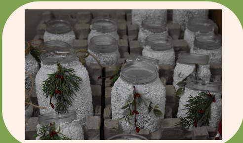
Table Centerpiece can be made at the Pulaski County Extension Office on Monday, December 16 at 1:00 pm. Free to homemakers and $5 to others.

January 15, 2025, 4:00 to 6:00 p.m. Store the Harvest by dehydrating, freeze drying, and other food preservations. Register by scanning OR Code on the web.