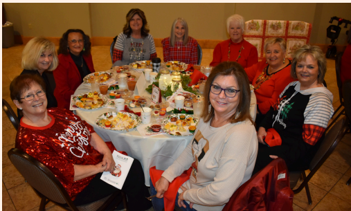
Even our Homemakers enjoyed taking the time to enjoy the Christmas Brunch.