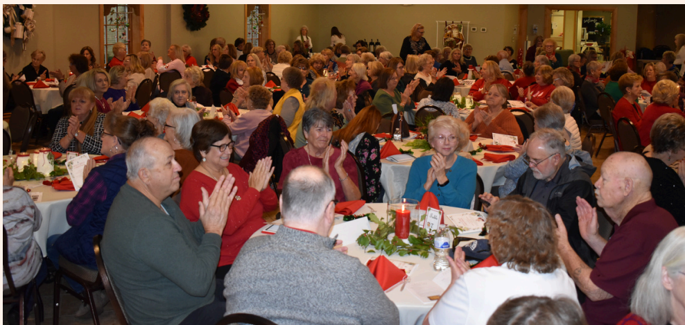
Even our mates enjoyed the brunch.