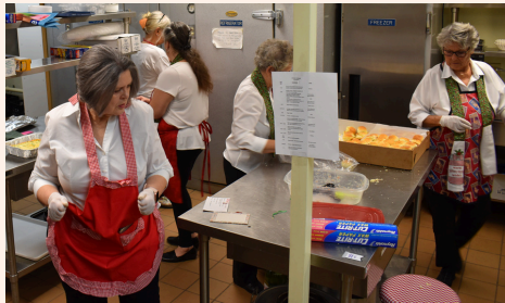
Our Kitchen Helpers never stopped. They worked until they dropped.