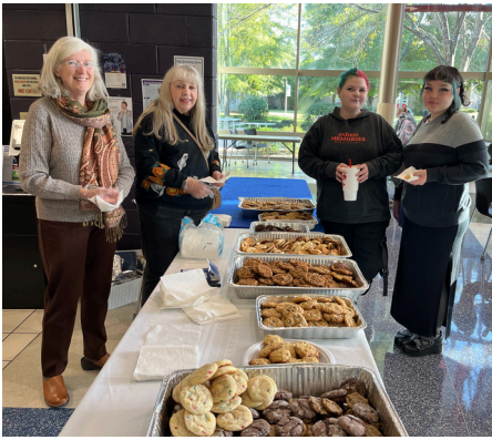
Visitors at the Somerset Community College International Day got to sample hundreds of cookies made and served by the Pulaski County Extension Homemakers.