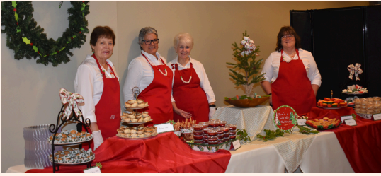
The dessert table was one of my favorites.