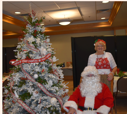
Even Santa Claus with his special mate was present for our "Holly Jolly Brunch."