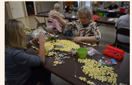
Our homemakers worked lots and lots of hours making handmade items for the Christmas Trees at our Holly Jolly Brunch.