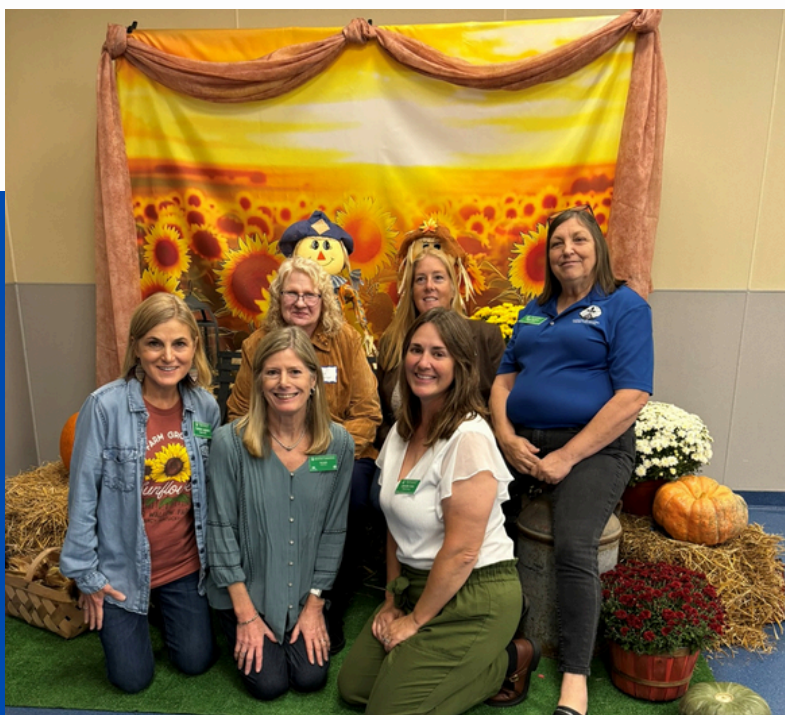
Lake Cumberland Master Gardeners Represented the group at the 2024 Kentucky State Master Gardener Conference.

Overall, Lake Cumberland Master Gardeners have lost some members due to life changes. However, new trainees are continually brought into the program to ensure a strong, sustainable program in the future.