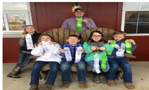
4-H Livestock Skillathon Team